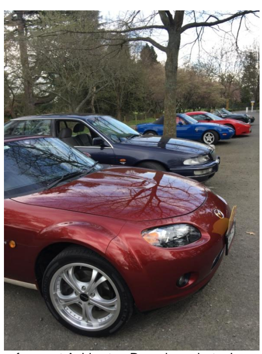
Line up of cars at Ashburton Domain

A good variety of cars arrived at the Rolly Inn carpark for our monthly outing and on this particular day some of us were going to be motoring on from Ashburton to Fairlie to join everyone participating in the Alpine Classic which began the following day. We decided to drive along the Main Highway, through Rakaia and turned left at Overdale for a bit of country motoring. We made our way to Fairfield Road, then Company Road to turn into the Ashburton Business Area to exit at Bremners Road. Turning on to West Sreet, we carried on to the Ashburton Domain for the lunch stop. After lunch most of us walked through to the new Museum and Art Gallery noting the blossom trees and well kept gardens along the way. On returning to our cars we said farewell to those returning to Christchurch as the others were heading south . Another enjoyable day in the sunshine. Gill Milne.