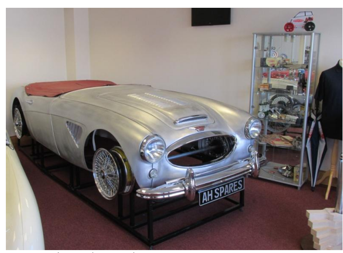
New Austin Healey – Who wants one!