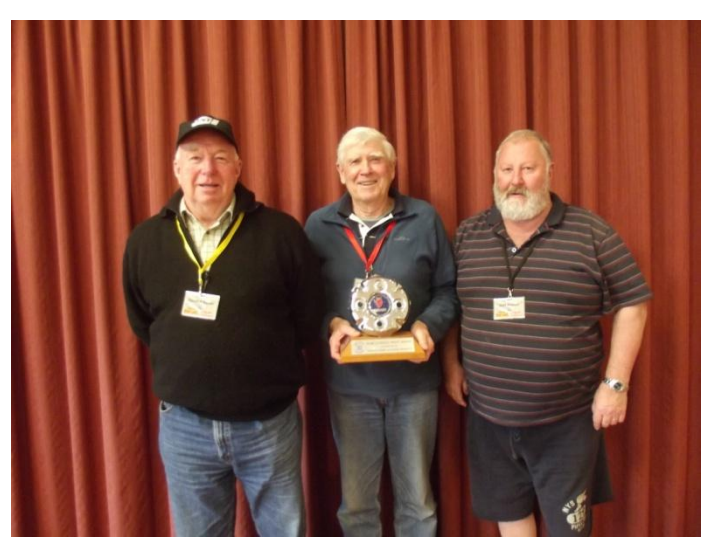
The Timaru Lads with their Saab Award