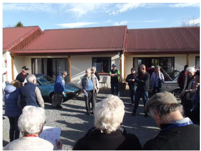
Day 1 Briefing at Fairlie