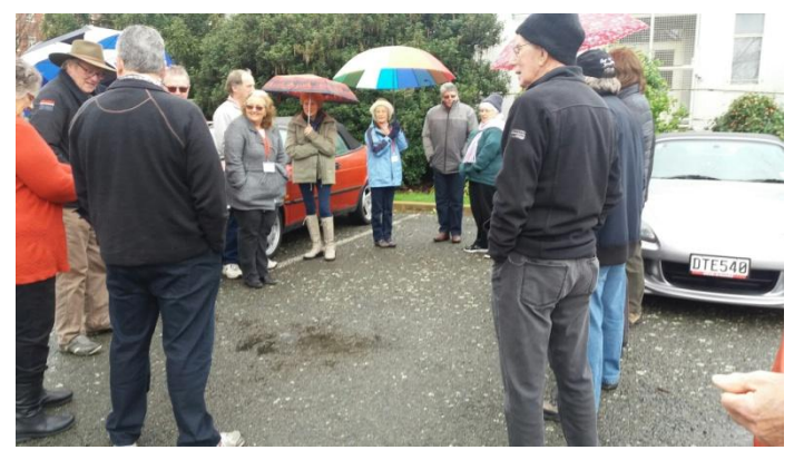
Brave club members ready for their Sunday Run

We had had a few days of inclement weather and the day dawned cold and wet. Mel decided after hearing road reports to cancel the run for the day.