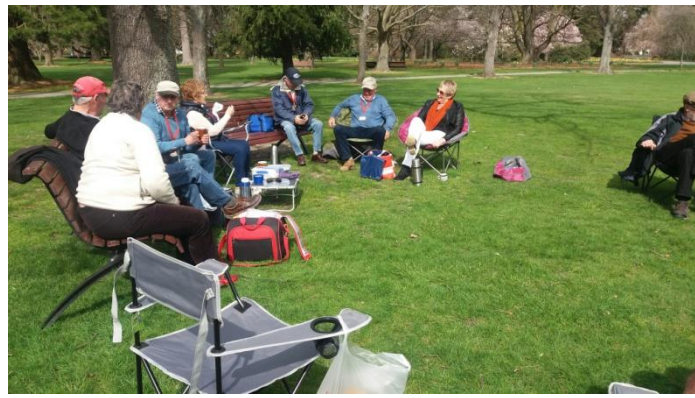
Lunch time in the Ashburton Domain

A good variety of cars arrived at the Rolly Inn carpark for our monthly outing and on this particular day some of us were going to be motoring on from Ashburton to Fairlie to join everyone participating in the Alpine Classic which began the following day. We decided to drive along the Main Highway, through Rakaia and turned left at Overdale for a bit of country motoring. We made our way to Fairfield Road, then Company Road to turn into the Ashburton Business Area to exit at Bremners Road. Turning on to West Sreet, we carried on to the Ashburton Domain for the lunch stop. After lunch most of us walked through to the new Museum and Art Gallery noting the blossom trees and well kept gardens along the way. On returning to our cars we said farewell to those returning to Christchurch as the others were heading south . Another enjoyable day in the sunshine. Gill Milne.