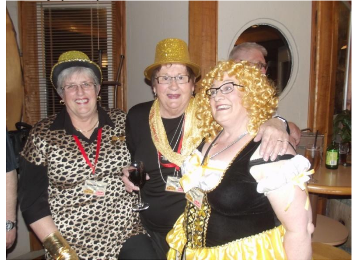
Dress up girls at Karamea.

When we left Stillwater the rain had really set in and we had a very wet drive up to Karamea – some of the cars had difficulty with water in their electrics. The Last Resort at Karamea was our stop and they provided us with an amazing evening meal and a delicious breakfast the next morning. The evening was enjoyed by all.